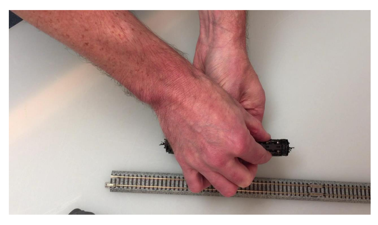
Step 2: Remove the couplers on either end (1 small Philips head screw to remove for each coupler).