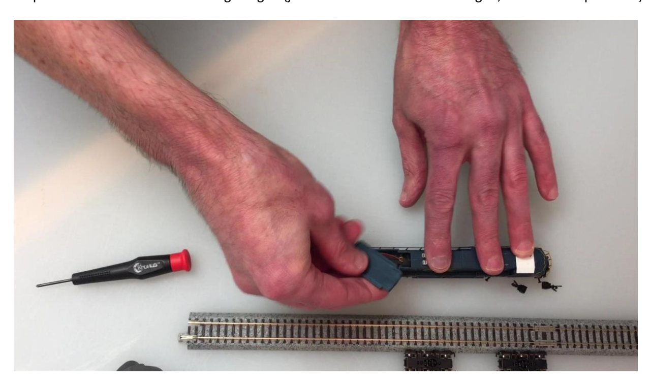
Step 4: Push down on the chassis while pulling up under the steps on the rear of the engine.